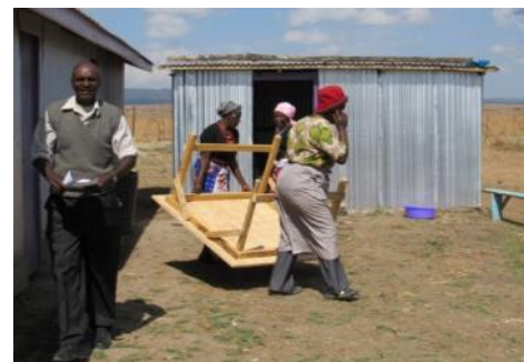
Everyone lends a hand in setting up for the Women's Leadership Conference.