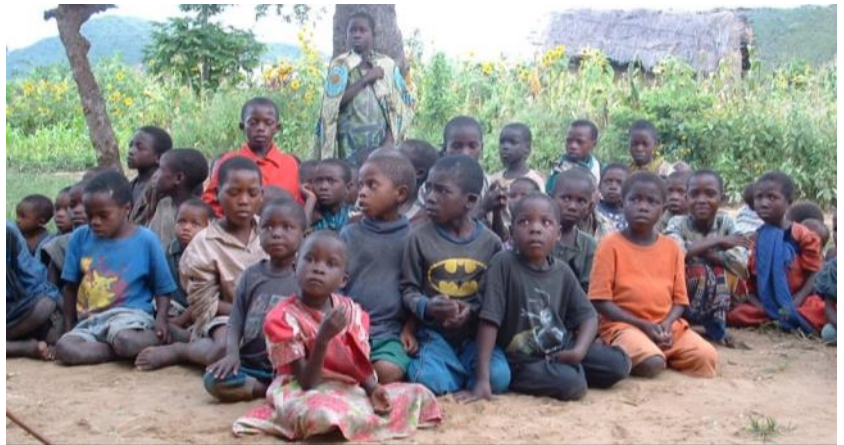
Some of these children were among the first orphans who came to the newly established Daily Bread Life Children's Home in Iringa, Tanzania, in 2004.