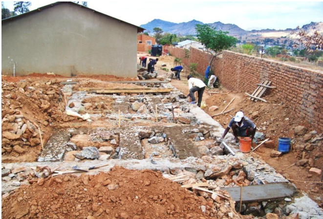
Work on the foundation of the new dormitory at Daily Bread Life Children's Home began in October.