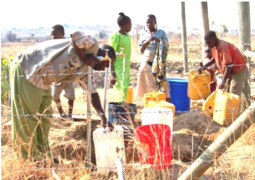
After many trials and tribulations, water has begun to flow to the village of Kidetete.

Helping God-Given Visions Become Present-Day Realities