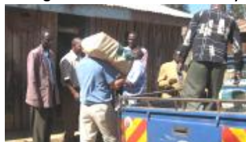
Pastors in Sipili, Kenya, line up to help unload the maize seed.