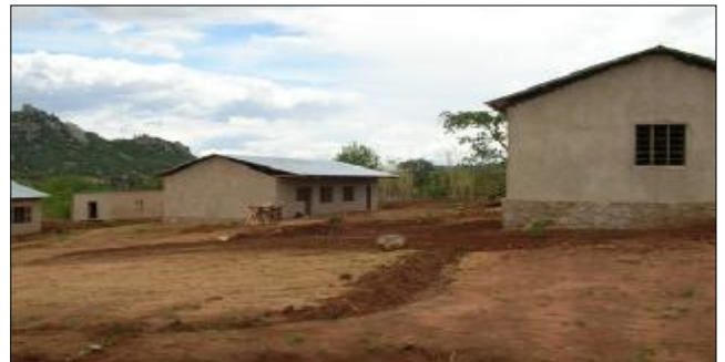
Construction is nearly complete on most of the buildings at the Tanzanian orphanage.