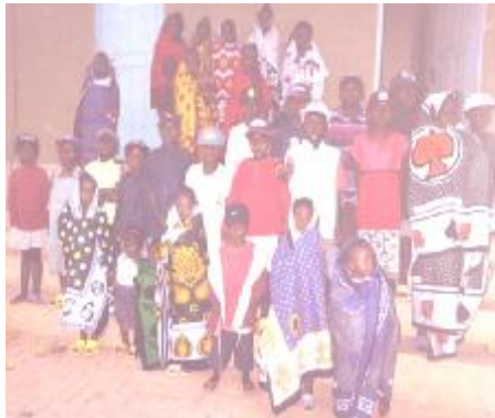
Children at the Children's Home model their new khangas (uniforms).

In a very short period of time, God has taken the dream of a few, shortened the distance between the United States and Tanzania, and created the reality of a place so many children now call home.