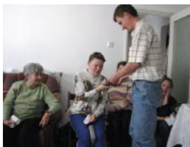
The Hope Group show their love for Jesus by helping each other.