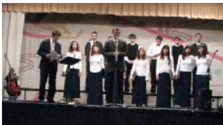
The Hosanna Young People's Choir of the Brasov church presented Jesus as the Light of the World in music, testimony and scripture.