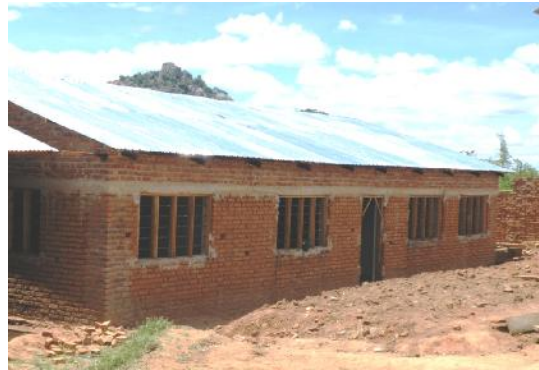
Construction of a new dormitory at the Daily Bread Life Children's Home began last fall and upon completion will house children there who have reached secondary school age.

In the weeks preceding these dates, we will be traveling to different locations to meet with you. We ask your prayers as we prepare and as we celebrate together. Watch for dates and events in the newsletter and on the web page.